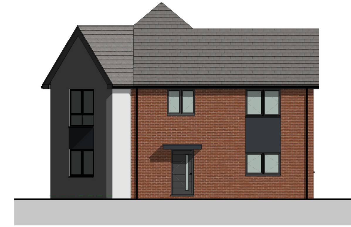
Plot 23 Plot 22