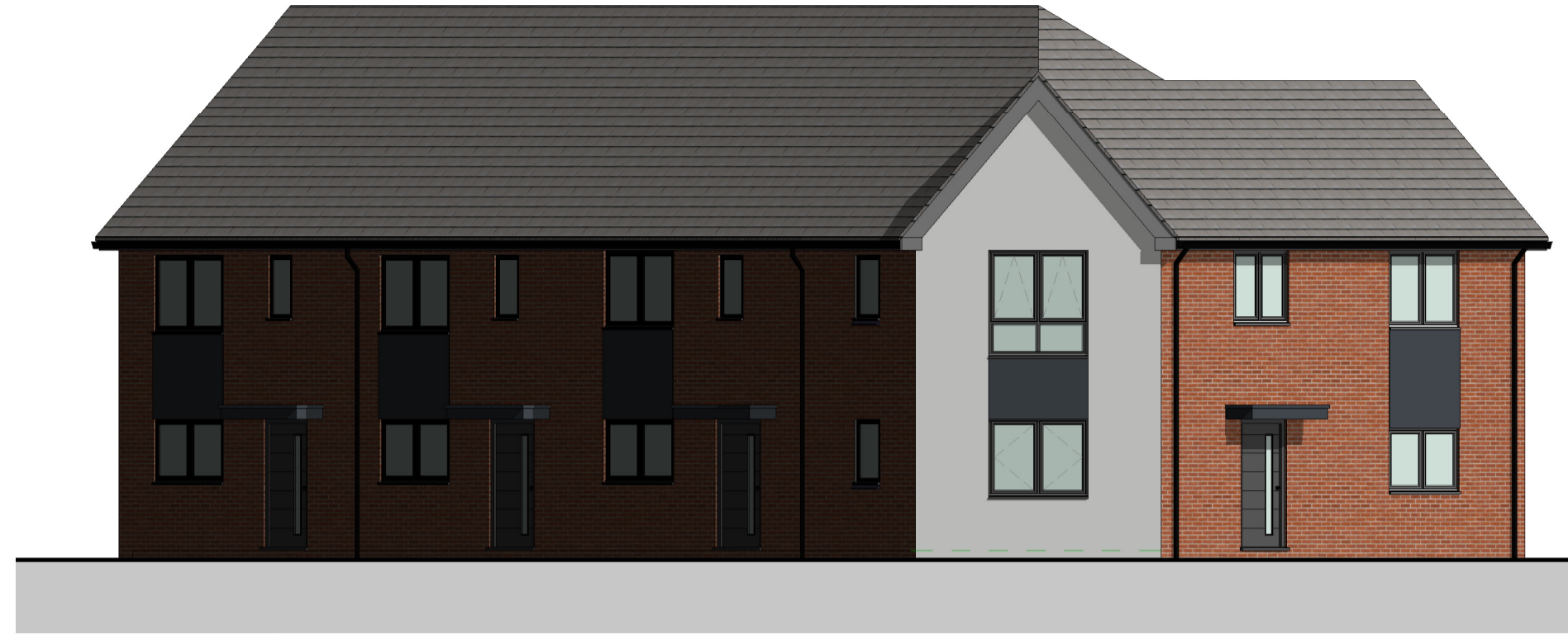
Plot 26 Plot 25 Plot 24 Plot 23 Plot 22