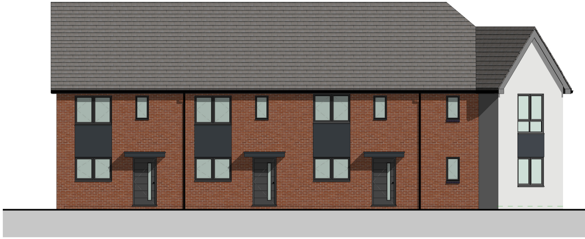
Plot 26 Plot 25 Plot 24 Plot 23